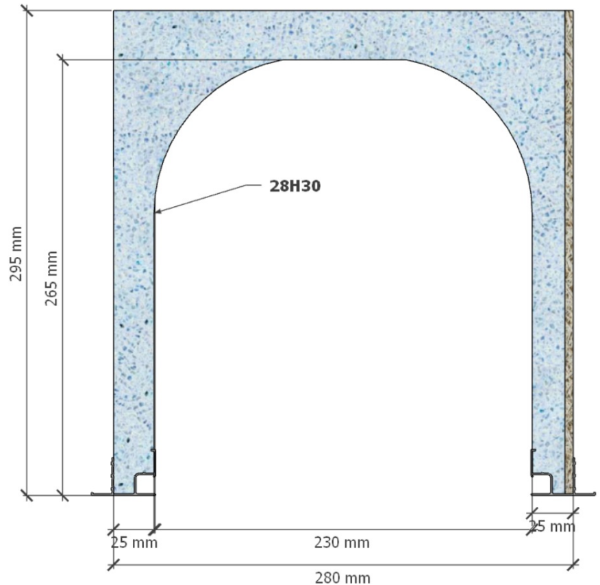
Box shown: C-28H30 8-8 F-NB